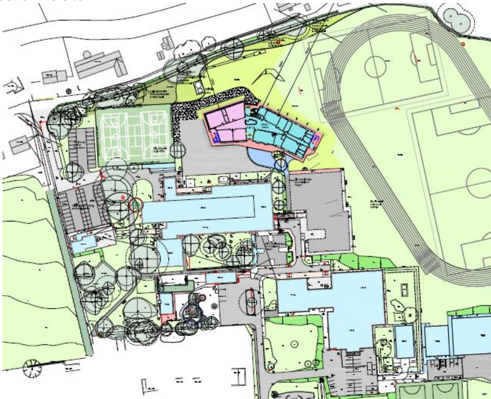
Site Location Plan with Proposed Layout

The existing Avon Valley College site is located at the north-east corner of Durrington. It is accessed along The Ham to the north and Recreation Road to the south, both are residential streets. Avon Valley College is located on a relatively large site at approximately 9.4 hectares. The application site itself is located on part of the existing sports facilities to the north-east of the site.